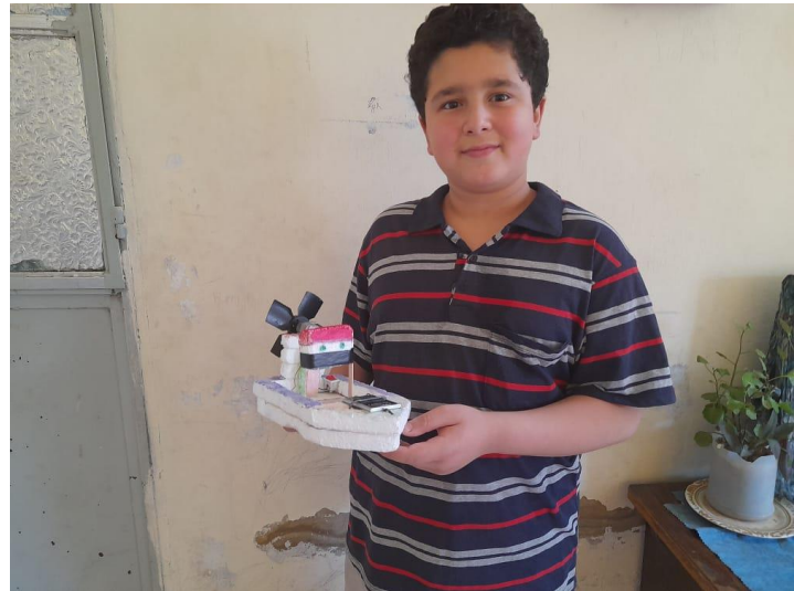
One of Amro's creations: a boat powered by batteries.

It is this kind of accompaniment, the attentiveness to the abilities of each child, that we hope to provide for all of our students for them to be free to pursue their dreams.