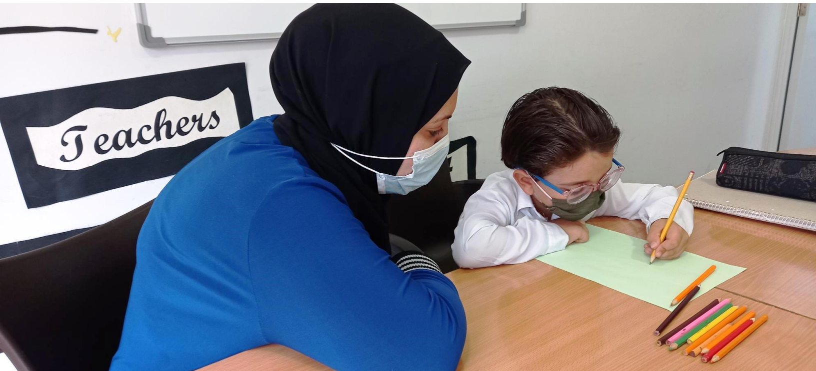
During a session with the social worker.